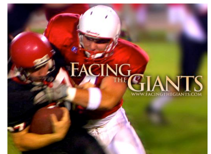
September 14th at 7pm - Family Movie Night: Facing the Giants